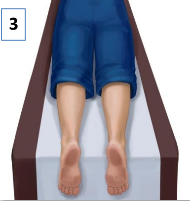
Alternative position - prone