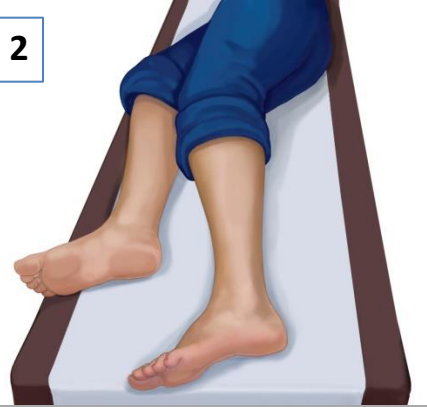
Alternative position – side*