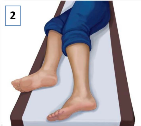
Alternative position – side*