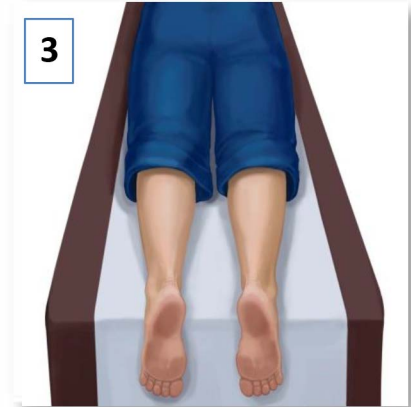
Alternative position - prone