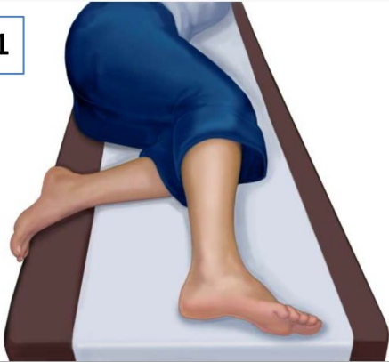
Preferred position – side*