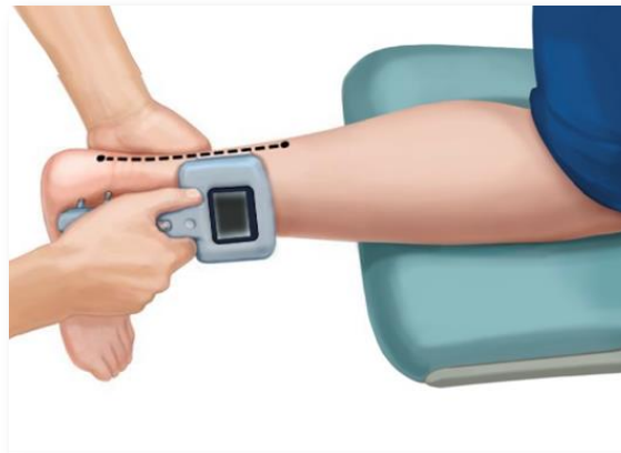
Alternative position - leg up