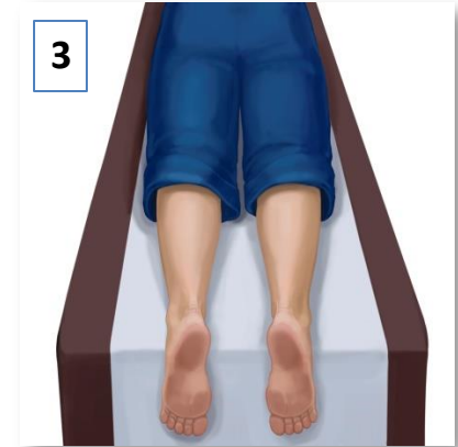
Alternative position - prone