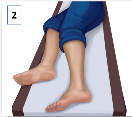
Alternative position – side*