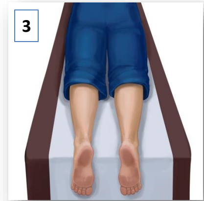
Alternative position - prone