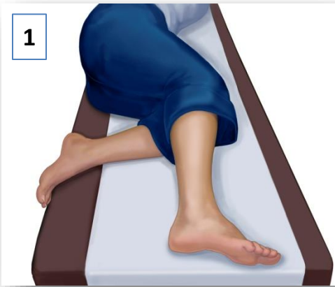
Preferred position – side*