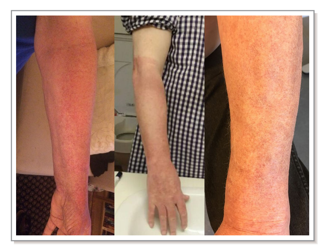
Figure 3. Adverse events. This figure shows pictures of the arm of all 3 patients experiencing adverse events.

However, intermittent claudication was not associated with reduced mortality in a study of patients with myocardial infarction, <sup>28</sup> indicating that patients with PAD may not experience preconditioning as a consequence of their atherosclerotic disease.