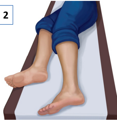
Alternative position – side*