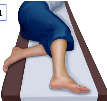
Preferred position – side*